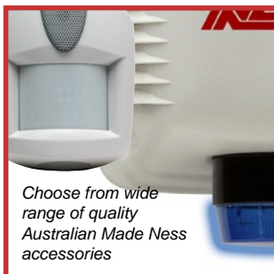
Choose from wide range of quality Australian Made Ness accessories

ECO8x is fully monitoring capable and ready for back-to-base monitoring or you can even have it call your mobile phone and speak an audible alarm message.