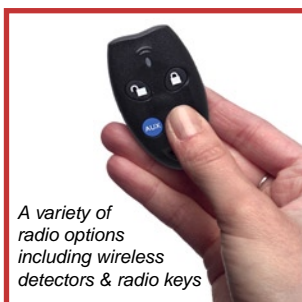
A variety of radio options including wireless detectors & radio keys